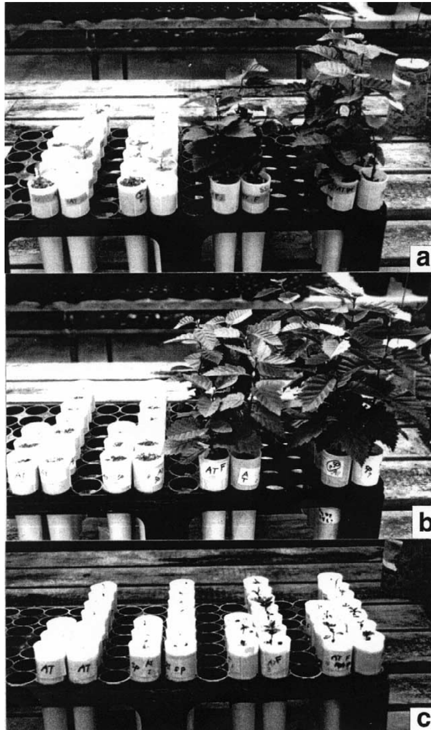
Figure 1. Alnus tenuifolia seedlings with different treatments. Seedlings in a mixture of large-particle ground basalt and perlite (a), in a mixture of small-particle ground basalt and perlite (b), or in perlite alone (c). The seedlings on the left are controls; the seedlings next to the controls are treated, from left to right, with Alpova diplophloeus , Frankia , and A. diplophloeus + Frankia .