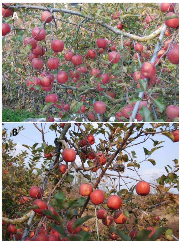
Fig. 1. Effect of bacilli spore preparation on apple growth. The biopreparation at 10^7 CFU/g spray was applied to the foliar parts of apple trees cv. Fuji from May 16 to October 27, 2009, every two weeks through the use of an automatic spray machine. (A) Representative photograph taken 6 months after the first foliar application of the biopreparation. (B) Representative photograph of the control plant taken around the same date.

compared to control untreated control trees (panel (B) in Fig. 1). Evaluation of the leaf thickness in treated and untreated trees revealed significant differences (Fig. 2). Surprisingly, the biopreparation treatment increased leaf thickness by as much as 155% compared to untreated controls (Fig. 2A). This increase in leaf tissue biomass could result in changes in the rate of photosynthesis due to the higher number of chlorophyll cells present in the leaves (Fig. 2B). The effect of the biopreparation on the quantification of photosynthetic rate was assessed using a portable photosynthesis meter, which showed a 150% increase of chlorophyll a content in biopreparation-treated leaves (Fig. 2B). The treatment of leaves with bacilli spores increased the water and glucose contents of the apples by 123% and 117%, respectively (Fig. 3A and 3B). Interestingly, apples derived from biopreparation-treated trees showed 15.5° brix while the control apples measured 14.7° brix (Fig. 3C).