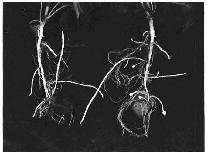
Fig. 2. Typical increase in potato stolonization and early tuberization resulting from treatment of seedpieces with plant growth-promoting rhizobacteria (on right) compared with untreated control (on left). The increases were statistically significant in all field tests.

b Pseudomonas strains A1 and B10 are from potato periderm, E6 from celery root, and TL3B2 and TL3B1 from potato roots.